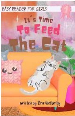
Kindergarten Easy Reader (Find On Amazon)