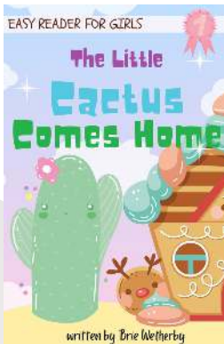
First Grade Easy Reader (Find On Amazon)