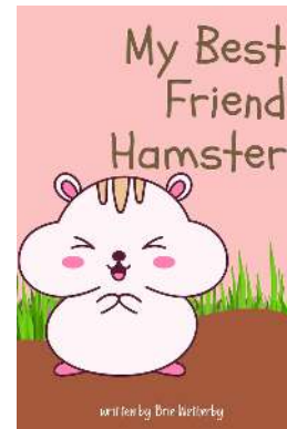
First Grade Easy Reader (Find On Amazon)