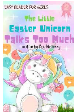
First Grade Easy Reader (Find On Amazon)