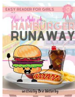
Second Grade Easy Reader (Find On Amazon)