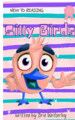
Preschool Easy Reader (Find On Amazon)